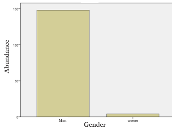
Fig. 1. Frequency distribution chart of respondents by gender.

The table above shows that 97.4% of people are men, and 2.6% are women.