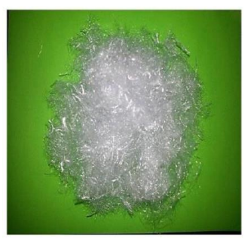
Fig. 2. Fibers before separation.