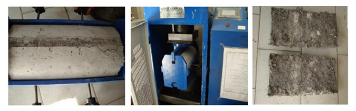
Fig. 5. Testing to determine the tensile strength of cylindrical specimens using the Brazilian method.