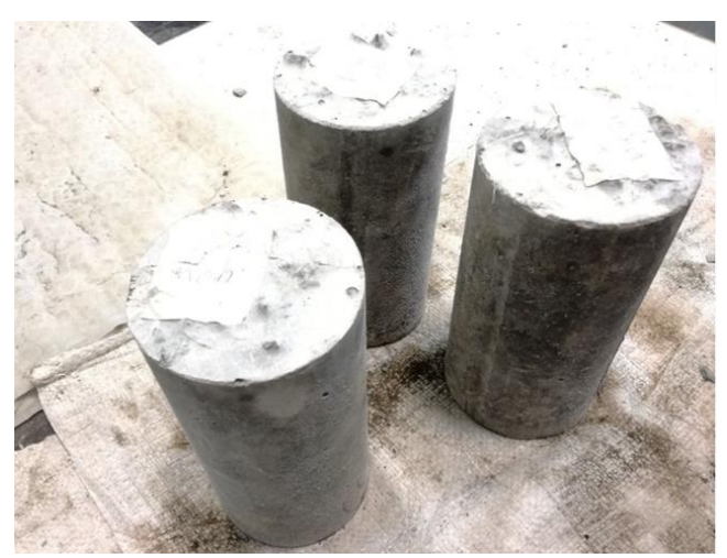
Fig. 4. Cylindrical samples for testing tensile strength.

This test is performed based on the ASTM C496 standard method according to Fig. 4 on cylindrical specimens. The conditions for preparation and storage of these samples are the same as for pressure samples. The test method is to measure the diameter and height of the sample, mark the two levels of the base of the sample with two perpendicular lines, and place the sample between the plates of the concrete breaker jack. For the balanced distribution of pressure, we use two wooden blades at the top and bottom of the samples. The load is gradually increased, and as a result of the pressure in the direction perpendicular to the tensile stress, the sample breaks. The increase in load will be uniform and at a rate equal to 7 to 14 kilograms of force per square centimeter per minute until the sample breaks. At this time, the maximum incoming load is read and recorded by the device.