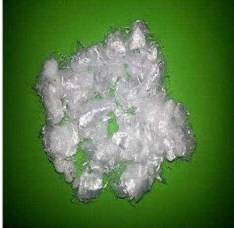
Fig. 1. Polypropylene fibers after separation by hand.