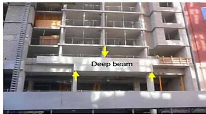
Fig. 1. Deep beams.

Reinforcement of beams with openings depends especially on its categories. In the construction industry, openings in deep beams are primarily classified as pre-planned or post-planned openings. Factors such as location, size and shape are already identified during the construction phase in pre-planned openings. Hence, it is beneficial to provide adequate reinforcement and serviceability of spandrel beams during construction. This factor improves the reinforcement behavior of a deep beam with openings. Considering the case of post-planning openings, the existing beam element is drilled for openings that affect the performance of the structure. However, specific guidelines or standards regarding structural element openings are not currently available in any of the major codes. During the process of loading the pipes and conduits of the installation, problems may occur. Opening positions in the deep beam are provided or relocated by mechanical and electrical engineers [14].