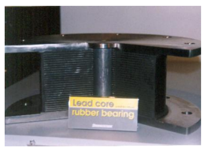
Fig. 1. Rubber seismic isolator system with lead core.

Fig. 1 shows a picture of this type of seismic isolation system. So far, this type of system has been used in the construction of a number of bridges and important buildings, as well as in the seismic strengthening and improvement of some historical buildings.