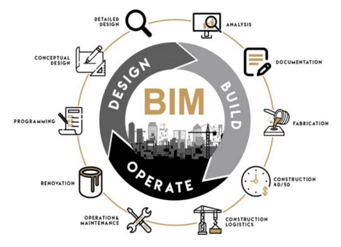
Fig. 2. Integrated BIM model.