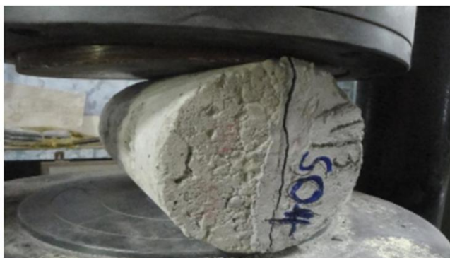
Fig. 2. Image of the concrete sample in the testing machine.

In this method, a diagonal compressive force is applied at a certain speed along the length of the cylindrical concrete test piece until rupture occurs. This loading causes tensile stresses on the surface subjected to relatively high compressive loads and stresses. Tensile rupture occurs earlier than compressive rupture because the load application surfaces are triaxial in compression. As a result, they bear much more compressive stresses than the uniaxial compressive strength test. For loading, thin support strips made of plywood are used to spread the applied load along the length of the cylinder.