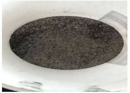
Fig. 2. A picture of RHA used in this study.