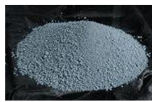
Fig. 1. Shape and size of microsilica in the experiment.