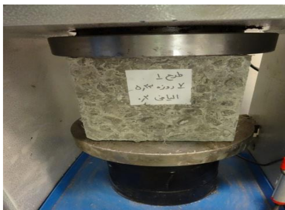
Fig. 11. Placing the cubic sample in the machine.

Compressive strength is the ability of the structure to carry loads on its surface without any cracking or deflection. In fact, the material under compression tends to decrease in size, while in tension, we encounter an increase in the sample length [11]. The compressive strength of concrete depends on many factors, such as water-cement ratio, cement strength, quality of concrete materials, quality control during concrete production, etc. The compressive strength test was performed according to the ASTM C39 standard on cubic samples with a dimension of 15 cm [12]. The exact weight of the compressed samples was obtained with a scale one day after they were taken out of the water. After that, the sample was placed in the machine's center from the flat part and tested (Fig. 11).