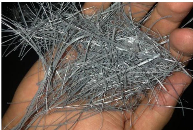
Fig. 3. Needle-shaped polyolefin fibers.