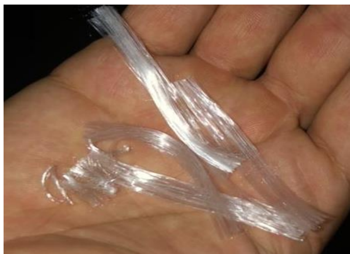
Fig. 4. Polyolefin network fibers.