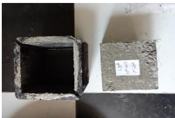
Fig. 8. Concrete samples 24 hours after construction.

For the compressive strength test, cubic samples with dimensions of 15 cm and tensile strength were considered on cylindrical samples with dimensions of 20 x 10 cm. Table 5 shows three compressive strength samples, and two tensile strength samples were made for testing at 7 and 28 days. Twenty-five samples were tested for compressive strength and 20 samples for tensile strength.