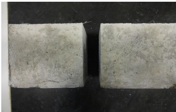
Fig. 12. Cracking pattern of concrete samples after pressure test.

Fig. 12 shows the concrete sample with composite fibers after the pressure test. Single-strand fibers mixed with network fibers can quickly form a broader network structure, reduce the stress concentration of concrete at the beginning of cracks, and thus increase compressive strength. Compared with the failure pattern of plain concrete, it can be concluded that the cracks on the surface of concrete reinforced with fibers are finer, more numerous, and widely distributed. It indicates that fiber-reinforced concrete is not entirely crushed under axial stress, and fibers play an essential role in strengthening the crack resistance, which causes multiple deviations from the crack propagation path and the occurrence of secondary cracks.