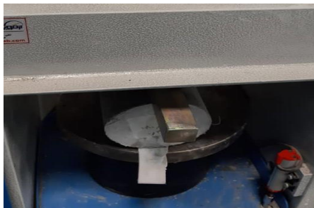
Fig. 10. Placing the cylindrical sample in the machine.

This test was done based on the ASTM C496 standard on cylindrical samples with dimensions of 20 x 10 cm [9]. The sample was placed horizontally between two metal strips inside the fragile concrete device, and the test was performed (Fig. 10). The relation T=2P/\pi ld was used to calculate the tensile strength value. P is the load caused by sample failure, l is the height, and d is the diameter of the standard cylindrical sample [10].