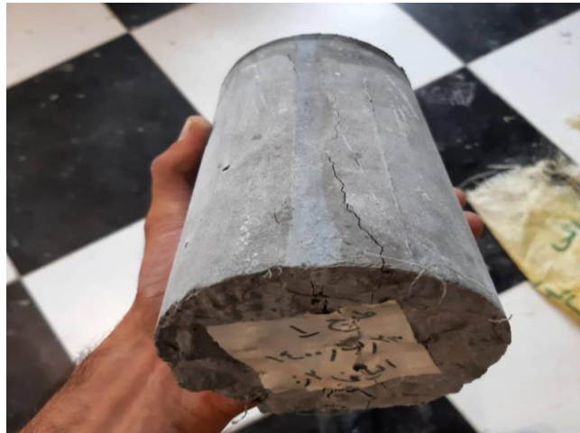
Fig. 13. Cracking pattern of concrete samples after tensile test.

According to the cracking pattern of the sample after the tensile test ( Fig. 13 ) in the initial stage of concrete cracking, several primary fibers eliminate micro-cracks and prevent expansion. When the tensile stress breaks the samples, the stress is transferred to the coarser and stronger monofilament fibers, so it can stop the large cracks and improve the crack tensile strength significantly.