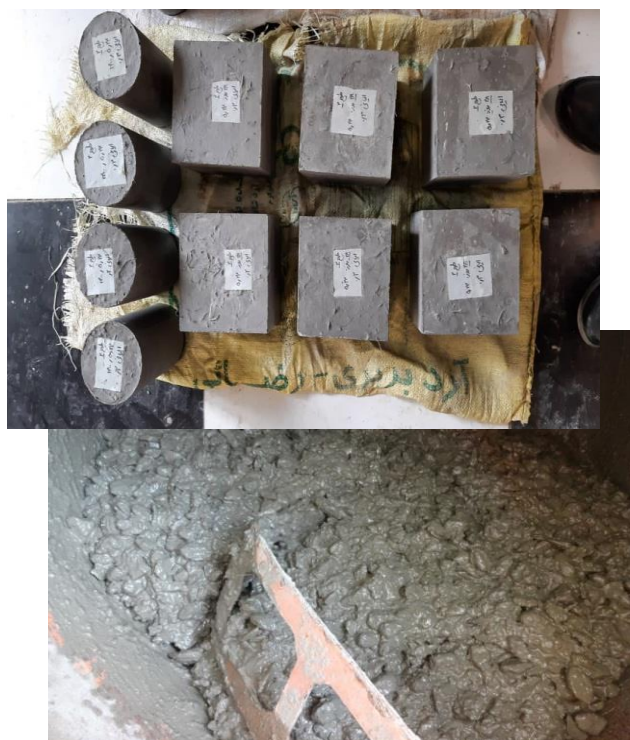
Fig. 7. Concrete samples after being removed from the mold.