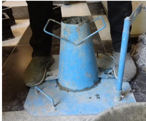
Fig. 9. Poured concrete in the slump cone.

The concrete slump test measures the consistency of fresh concrete before it hardens and is in its fresh state. This work is done to check the performance of the concrete and, thus, the ease of concrete flow [7]. This test uses a cone-shaped metal mold, which is open on both sides and has attached handles. The tool typically has an inside diameter of 100mm at the top and 200mm at the bottom, with a height of 305mm. The cone is placed on a hard, non-absorbent surface. This cone is filled with fresh concrete in three stages, and each time, it is hit 25 times with a metal rod; in the third stage, the concrete surface becomes completely smooth and uniform ( Fig. 9 ). At the end, the cone is completely pulled up, and the amount of concrete falling is measured compared to the initial level.